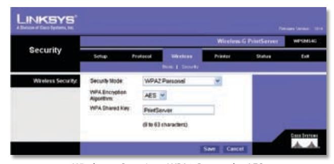
Wireless > Security > WPA2-Personal > AES

WPA Encryption Algorithm AES is the default algorithm. TKIP is also available.